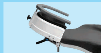
Head Rest Tilting

The operation platform is made of anti-static polyurethane cover that is well cushion and wide enough to offer comfort to the patient while on it.