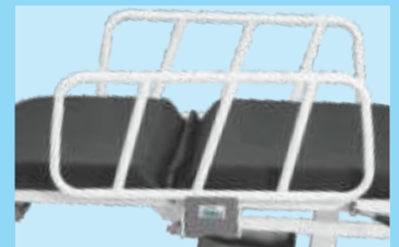
Optional Side Safety Bar