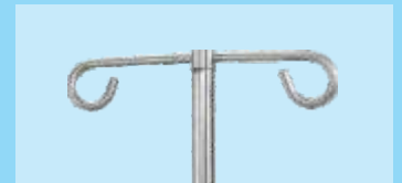
I V Pole