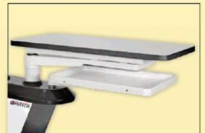
Open Lens Tray