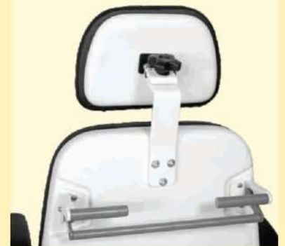
Back side lever, Manual push an down position