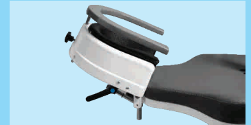
Had Rest Titing