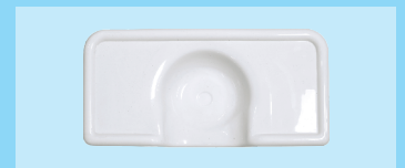
Optional V R Surgery Head